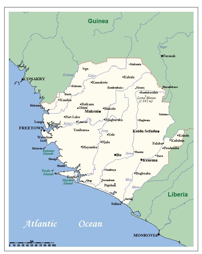
Source: Kelisi. A map showing Sierra Leone's cities, main towns, selected villages and highest point. [home page on the Internet] 2008 [cited 2019 March 15]. Available from https://zh.wikipedia.org/wiki/File:SierraLeoneOMC.png.<sup>1</sup>