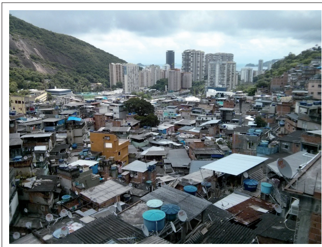
FIGURE 2: The community of Rocinha, viewed from the entrance to the clinic.